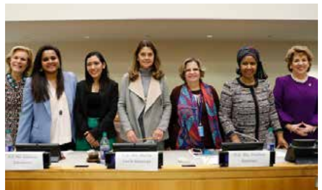
“Take the Hot Seat” Intergenerational Dialogue

These assumptions have been considered in the creation of the actions and indicators in the NAP in order to mitigate risk of inability to achieve the objectives of the plan. They will continue to be revised and taken into consideration throughout the duration of the NAP, particularly during the annual reporting and Mid-Term Review and Final Evaluation.