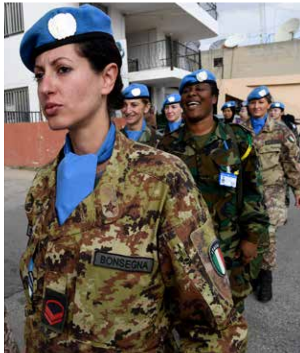
Women Peacekeepers in Lebanon with UNIFIL

The United Nations Security Council Resolution (UNSCR) 1325, was adopted in 2000, and marked a watershed moment when the international community recognised the particular impact of conflict on women and girls. UNSCR 1325 has been reinforced by eight subsequent resolutions and is structured around thematic pillars. The Women, Peace and Security (WPS) Agenda recognises both the particularly adverse effect of conflict on women and girls, as well as their critical role in conflict prevention, peace negotiations, peacebuilding, mediation, and governance.