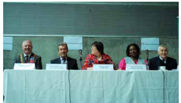
Expert panel during the Public Consultation in Cork on the development of the National Action Plan

This third plan takes into account the recommendations of evaluations and reviews of the previous plans and the changing and increasingly complex nature of contemporary conflict. It reflects a strengthened focus on ensuring an integrated and holistic approach to conflict prevention, the conclusions of the UN 2015 Global Study on the implementation of the WPS Agenda 3 , the agreement of the UN Sustainable Development Goals, and the adoption of the EU Strategic Approach 4 to WPS.