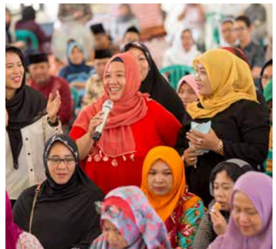
Indonesia - Community Peacebuilding Discussions.