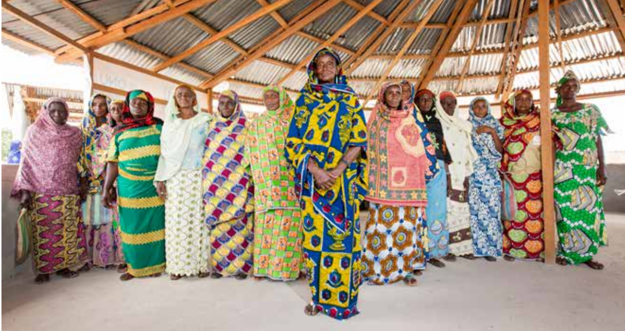
UN Women Humanitarian Work with Refugees in Cameroon.