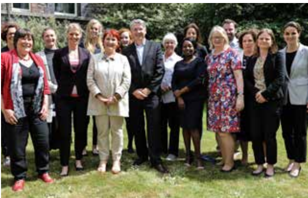
Regional Acceleration Resolution 1325 Workshop, June 2018, participants with Secretary General Niall Burgess (centre)

This involves not only raising our own voice in support of the WPS Agenda but also working to raise the voice of women peacebuilders across Ireland and around the world. Through partnerships at the European Union, United Nations and African Union, as well as our partnership with the international financial institutions we will drive collective action to achieve the commitments under the WPS Agenda.