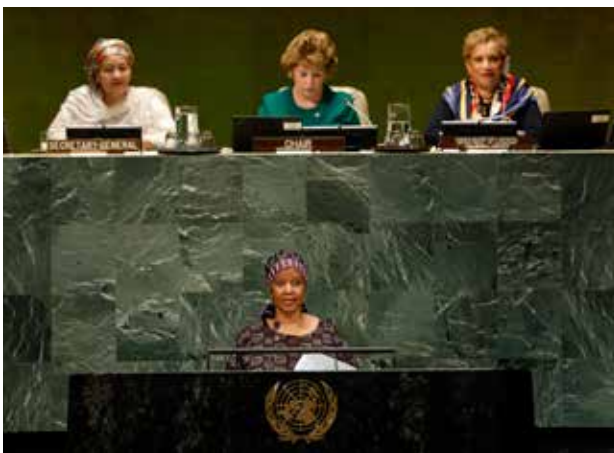
Above: Opening of the 63rd Session of the Commission on the Status of Women

A Working Group comprised of balanced representation from statutory bodies, civil society and academic experts with relevant experience of the WPS Agenda was established for the development of the NAP . Nominations were sought from the Oversight Group of the second NAP and members were appointed by the Tánaiste and Minister for Foreign Affairs and Trade. There was a focus on diversity and inclusion within the nomination process. The group's role was to advise and inform the development of the third NAP. It had an independent Chairperson and the Conflict Resolution Unit provided a Secretariat. 6