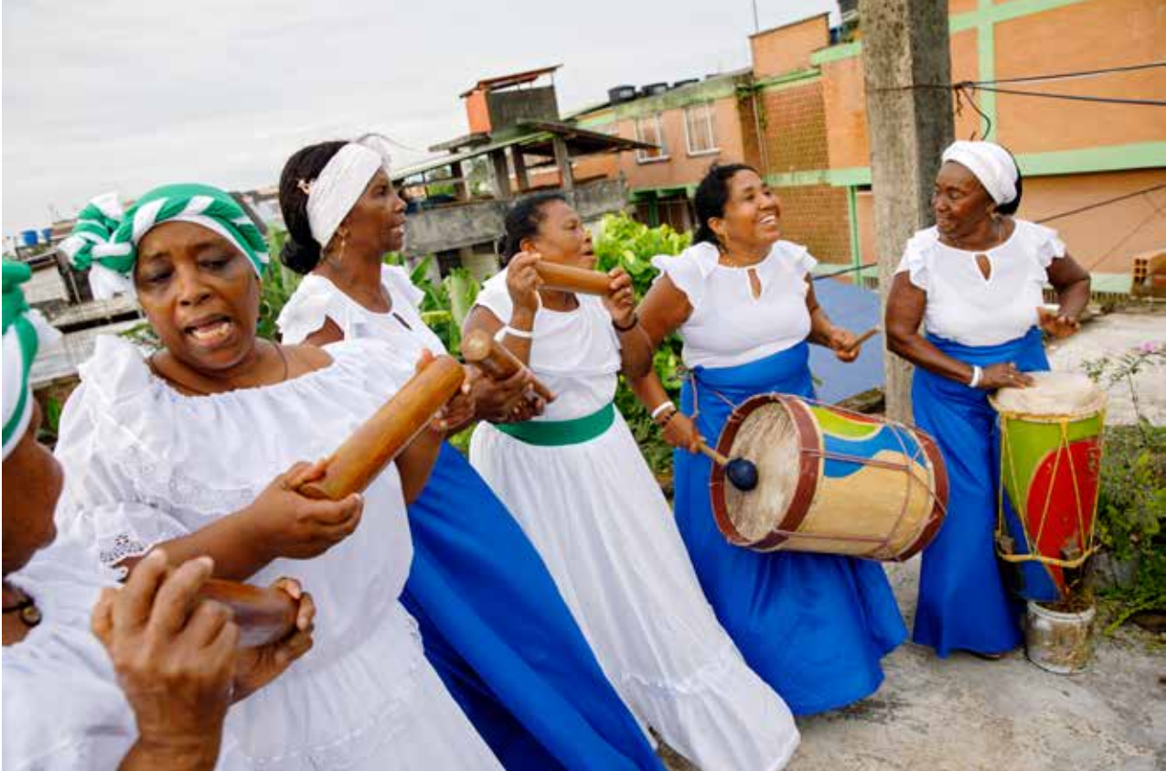
Colombia - preserving Afro-Colombian Culture through song