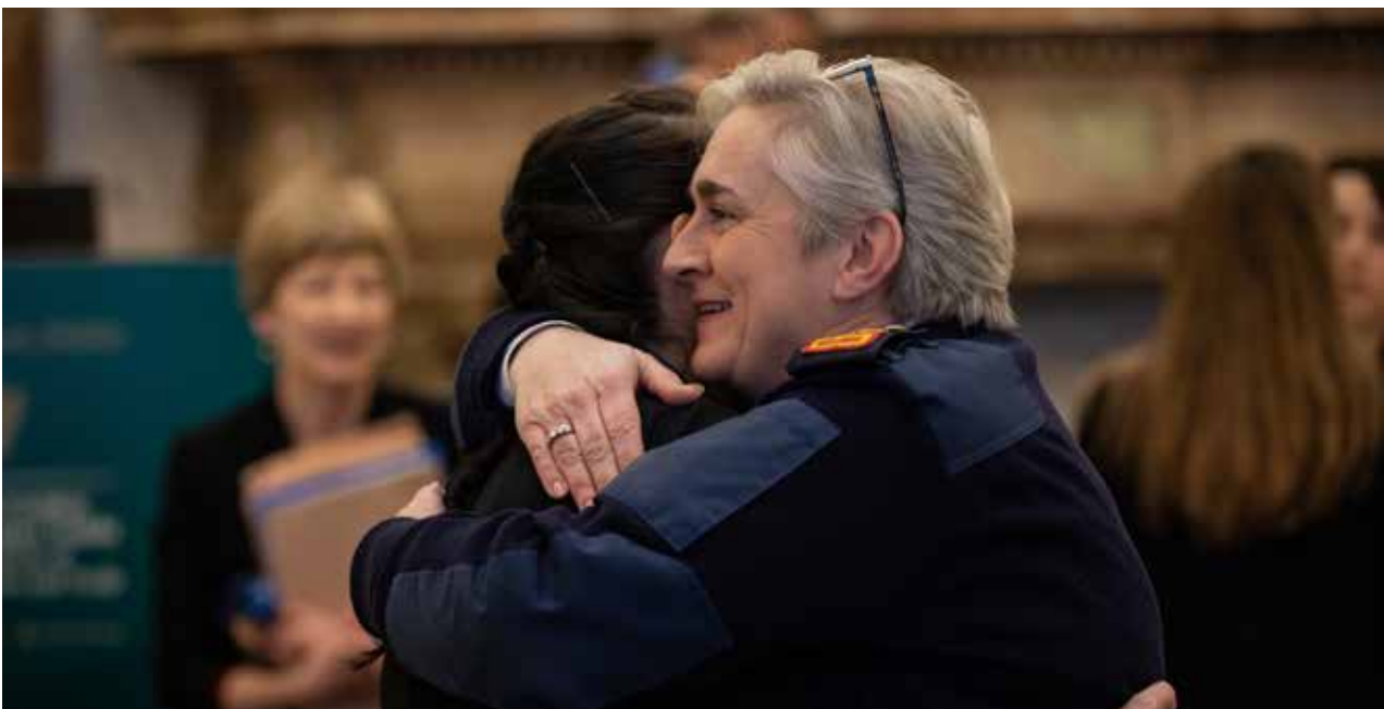
Public Consultation Workshop, Iveagh House, Department of Foreign Affairs and Trade.