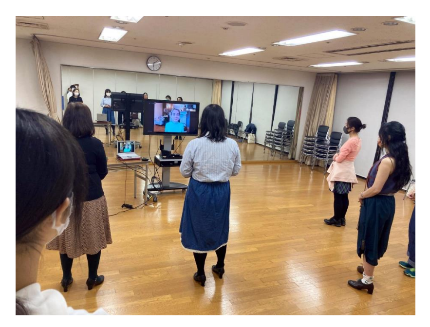
Sean Nós Dancing Class in Japan

In Britain, Comhaltas branches have linked with GAA clubs and Irish welfare organisations to support the Irish community through volunteering, maintaining contact with older isolated Irish people and providing mental health first aid training focused on supporting the Irish community during this difficult period.