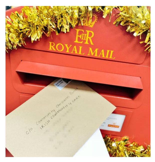
CARA #operationnollaig

Ten Irish organisations across the North West of England came together to deliver CARA, a dedicated Covid-19 response service to support their communities to stay safe, well and connected.