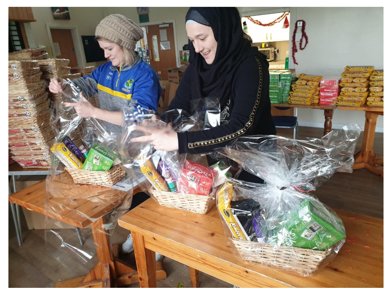
Emerald Centre volunteers preparing food packages