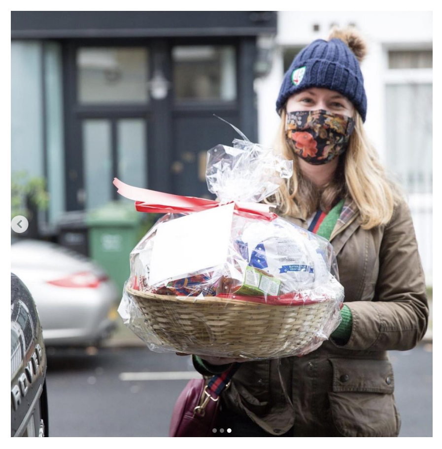
London Irish Centre's Covid Community Relief

intensive one to one support, bespoke activity bags and regular newsletters. This project, which was delivered in partnership with the Gypsy and Traveller Equality project (GATE), Comhaltas, GAA, Irish Studies Group, Irish Language Class, Leicester City Council, the Northfield Emerald Food Bank and many volunteers highlighted how effective organisations working in partnership can be in supporting their communities.