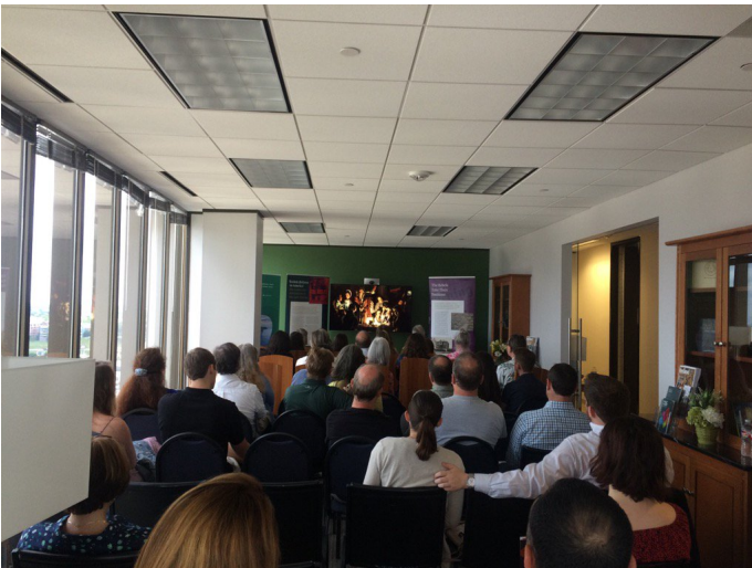
Audience watches Ireland 1916 Rising documentary in the Consulate

To commemorate the 100th anniversary of the Easter Rising, the Consulate screened the documentary “1916 The Irish Rebellion,” produced by the Keough Naughton School of Irish Studies at Notre Dame. Following remarks by the Consul General the capacity audience viewed the film which is narrated by Liam Neeson. The Consulate is working with communities across the US southwest on future screenings in other cities. The 1916 Rising exhibition is also currently on display at Ireland House Austin.