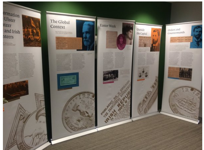
Commemoration Exhibition at the Consulate